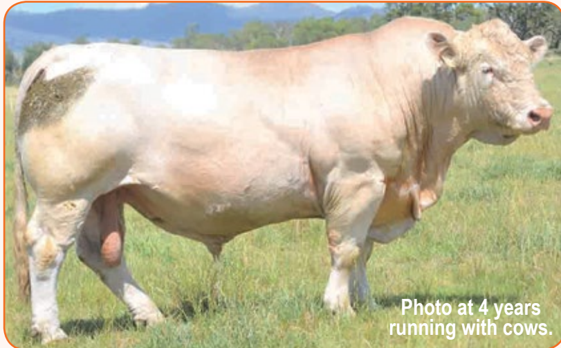
Photo at 4 years running with cows.

DAM: ROSEDALE HIGHNESS G114E (MR G114E) (P)