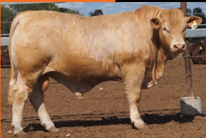
LOT 42 Composite Bull Suit Heifers