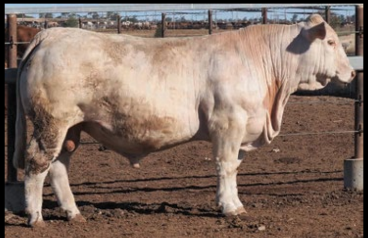
LOT 44 Suit Heifers