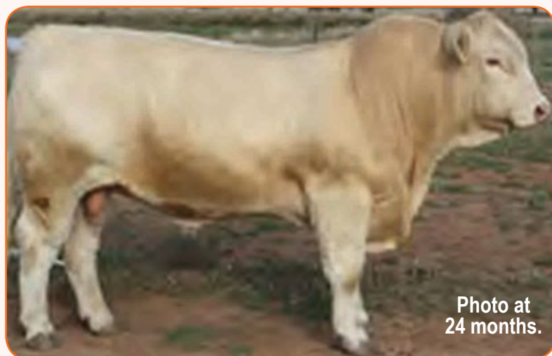
Photo at 24 months.

COMMENTS: Big strong Polled sire that has produced many great bulls in the Fairfield herd. High growth progeny with good bone, slick skin and fine hair, with great carcass and ability to finish.