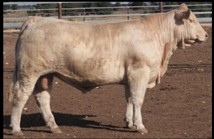
LOT 49 Suit Heifers