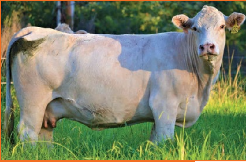
Dam of Lot 50