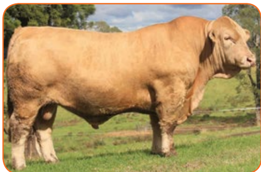
ACM Sire Shootout photo of Superbowl. Photo at 24 months.