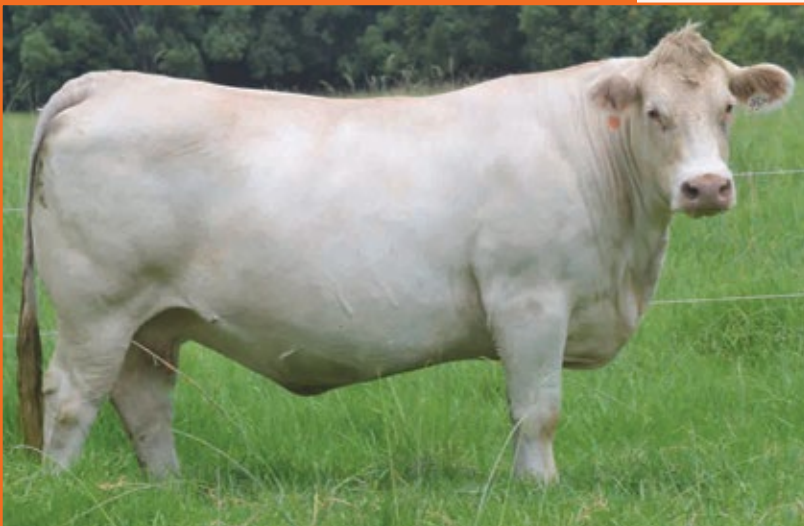
Dam of Lot 3