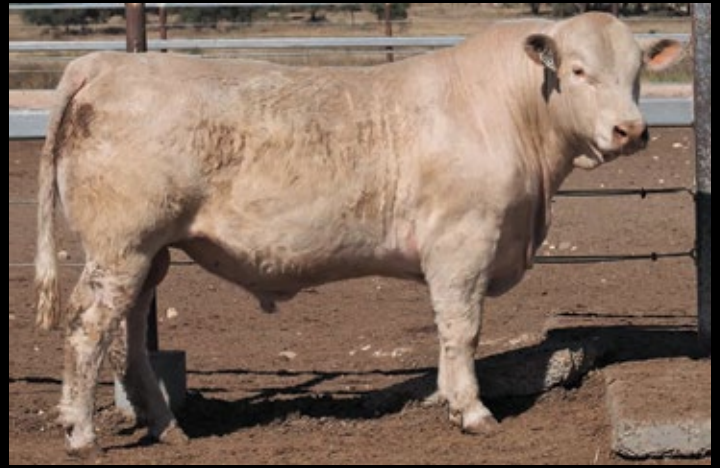
LOT 72 Suit Heifers