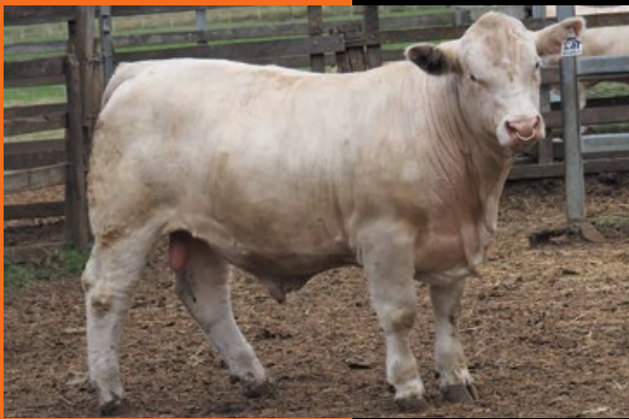
LOT 46 Suit Heifers