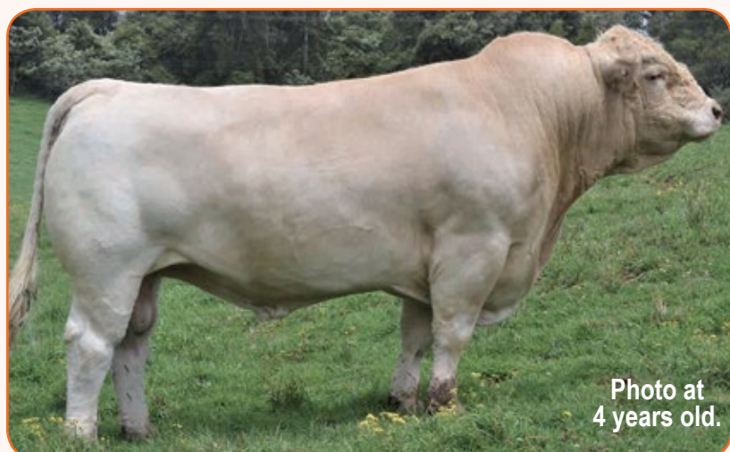
Photo at 4 years old.

DAM: THW TATT MAC D10E (THW D10E) (P) (AI)