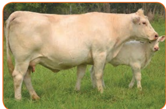
Dam of Superbowl on coastal country at 7 years of age, with 4 month old calf at foot.