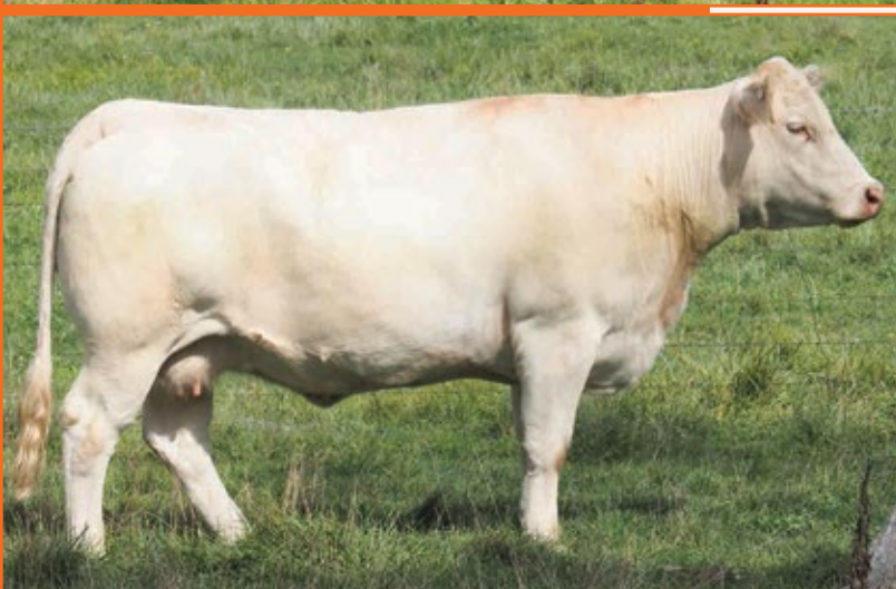
Dam of Lot 46