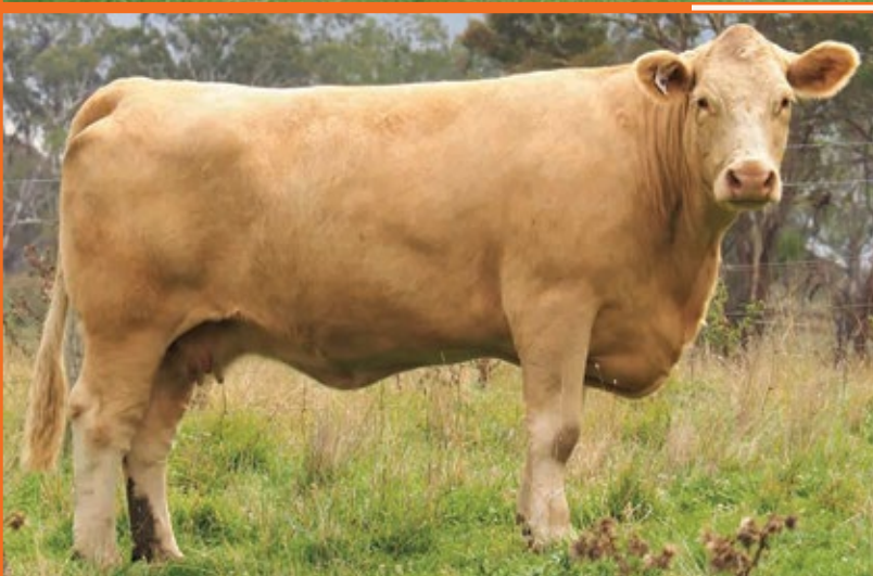
Dam of Lot 45