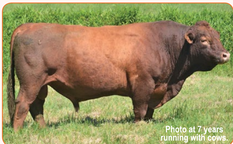
Photo at 7 years running with cows.

DAM: GLENLEA JANET U6E (GLE U6E) (R/F) (P) (TW)