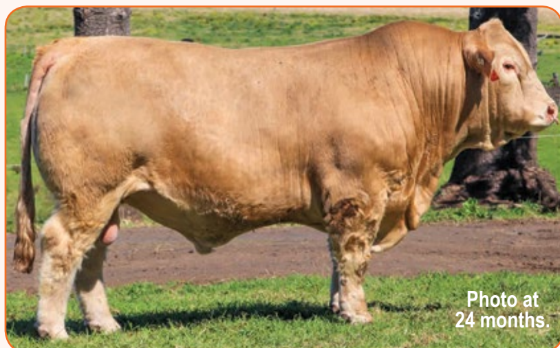
Photo at 24 months.

DAM: VALLEY VIEW ESTELLA 416 (VLWH26E) (AI) (ET) (P)