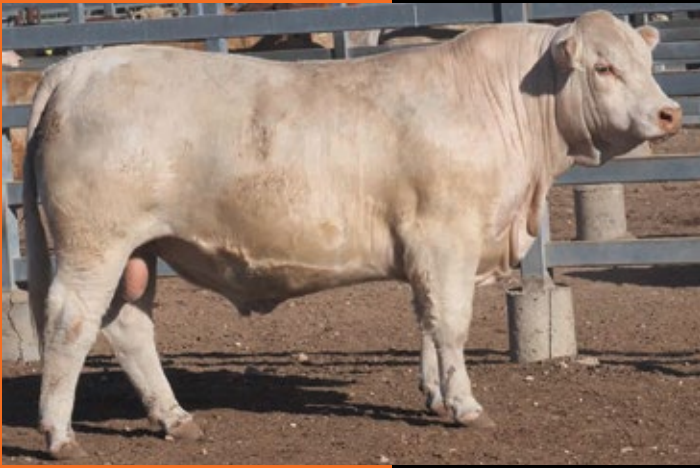
LOT 93 Suit Heifers