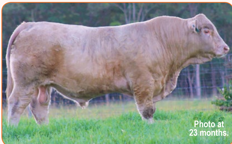
Photo at 23 months.