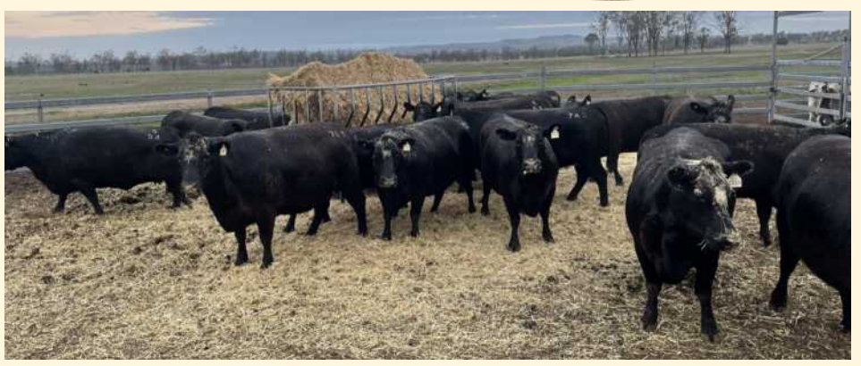
WHITAKER BEEF BULL SALE