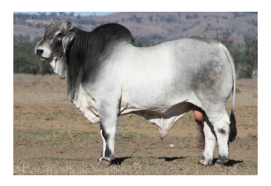
Whitaker Mr 3280 (P) selling as Lot 332 (RBWS 3 October 2023) Pre Sale inspections are always welcome. You won't be disappointed.