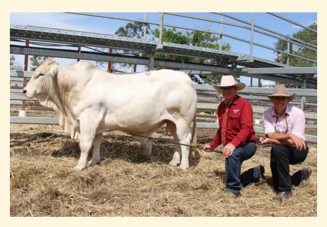
Top Price Bull at the 2022 WBBS was (Lot 3) selling to K C Slack of Gaynday for $15 000